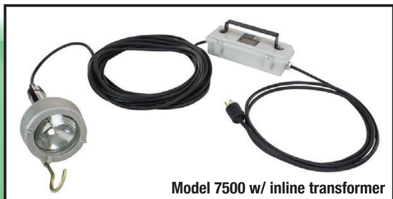
Model 7500 w/ inline transformer